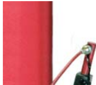
Load Lowering Valve #CV9596 and Tee For Operating Multiple HS10K's.

100 ft-lbs of force on the MS10K's 18" Ratchet Handle Provides 10,000# Of Spreading, Lifting and Leveling Force.