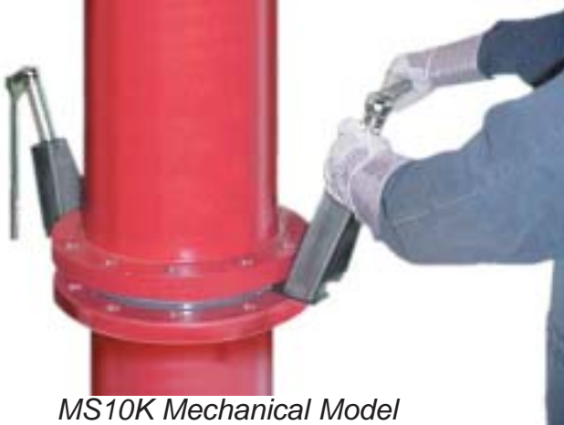
MS10K Mechanical Model

MS10K: Place the Manual Power-Spreader™ tips between the flange faces and turn the ratchet handle. The ratcheting action is transformed into 10,000 lbs. of spreading force and up to 3" of gap.