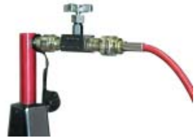
HS10K with HSCV Isolation Valve.

HS10K Hydraulic Flange Spreaders May Be Used In Multiple Units Connected To a Common Hand Pump. A Load Lowering Value As Shown Controls The Rate Of Travel. The Optional Isolation Valves Enable The Operator To Control Each Power-Spreader Independently.