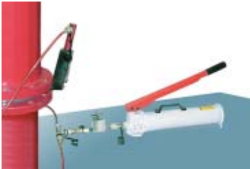
A 100H2 Hand Pump Operating a Pair Of HS10K's.

TITAN TECHNOLOGIES INTERNATIONAL, INC. SUPERIOR TECHNOLOGY • SUPERIOR SOLUTIONS