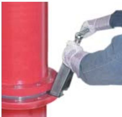
MS10K, Easy - One Man Operation.

100 ft-lbs of force on the MS10K's 18" Ratchet Handle Provides 10,000# Of Spreading, Lifting and Leveling Force.