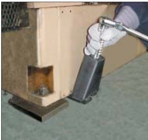
MS10K Leveling a Machine Tool