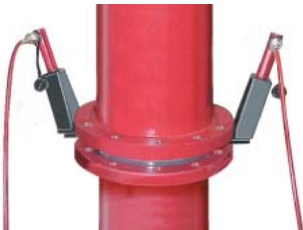
HS10K Hydraulic Model

HS10K: With the Hydraulic Power-Spreader™, a hydraulic cylinder replaces the ratchet handle. Power 1 or multiple Power-Spreaders™ easily using a standard hand pump. A pair of Power-Spreaders™ supply 20,000 lbs. of spreading force and 3" of travel; ample for gasket replacement or turning of blinds. Use a TITAN® power unit for best speed and performance.